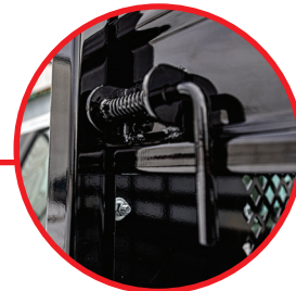
SPRING-LOADED, EASY-TO-ATTACH FRONT RACK LOCKS