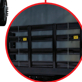
INTERCHANGEABLE, LIFT-OUT SIDE SECTIONS