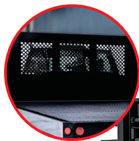
REDESIGNED LASER-CUT BULKHEAD WINDOW