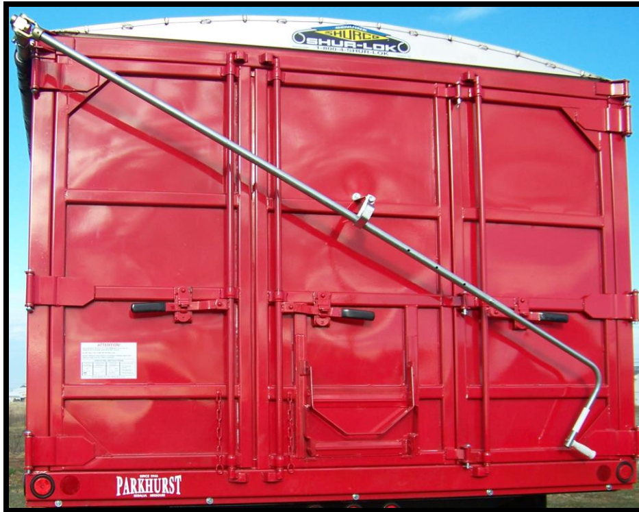
OR862 Triple Cargo Door

Three models of Parkhurst Rear Doors are offered to fit your grain or bulk hauling needs. Choose between Double Cargo Doors, Triple Cargo Doors, or the dump through style Beet Gate. Manufactured using high strength steel and heavy duty hinges, the rear doors will provide you with years of hassle free use. Call your local distributor and go check out the features of the Rear Doors. Put one on your truck today!