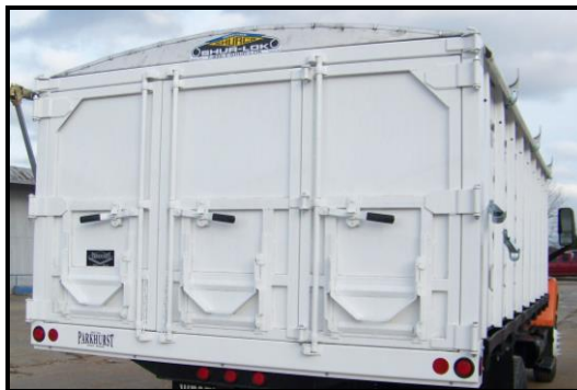
OR862-3MG Triple Cargo Door with 3 meter gates