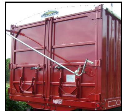
OR762 Double Cargo Door