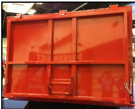
OR962 Beet Gate