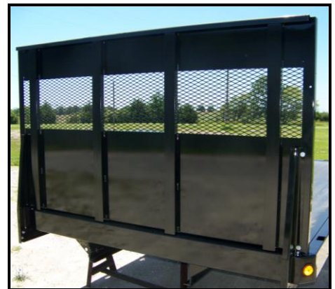
HDS5296 Heavy Duty Bulkhead