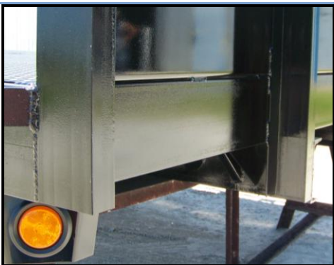
Lumber and Weld on Style