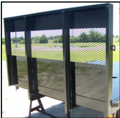
WBH5296 Weld on Heavy Duty Bulkhead

The Parkhurst Bulkhead lineup offers four models—Standard Duty, Heavy Duty, Lumber and Weld On Heavy Duty, assuring you will find the right one for your application. With their durable structure and full width screened windows, the bulkheads will provide strength and security for your loads. Call your local distributor and go check out the features of the Bulkheads. Put one on your truck today!