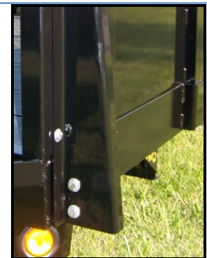
Structureline Knee Brace Gusset