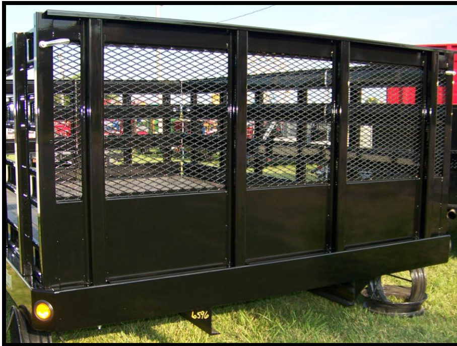
BH54296 Standard Duty Bulkhead

The Parkhurst Bulkhead lineup offers four models—Standard Duty, Heavy Duty, Lumber and Weld On Heavy Duty, assuring you will find the right one for your application. With their durable structure and full width screened windows, the bulkheads will provide strength and security for your loads. Call your local distributor and go check out the features of the Bulkheads. Put one on your truck today!