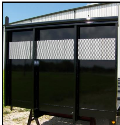
BHLBE9652 Lumber Bulkhead